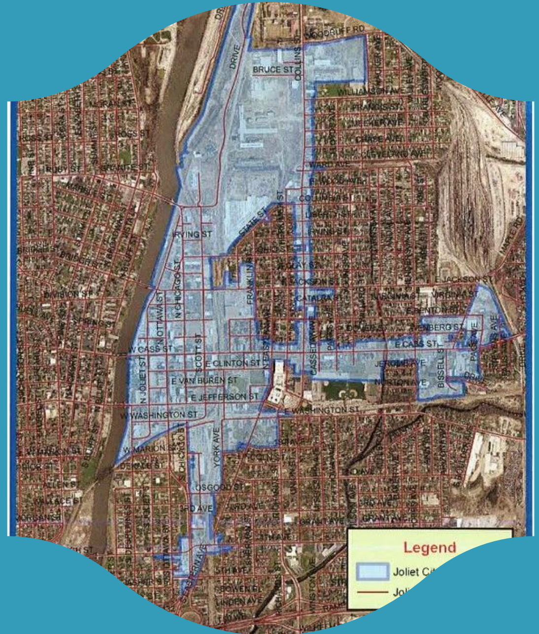
SPECIAL SERVICE AREA