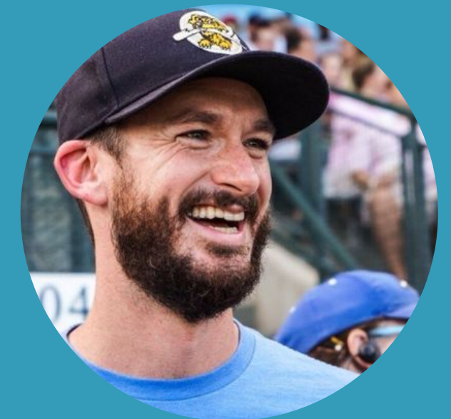
Night Train Veeck Joliet Slammers