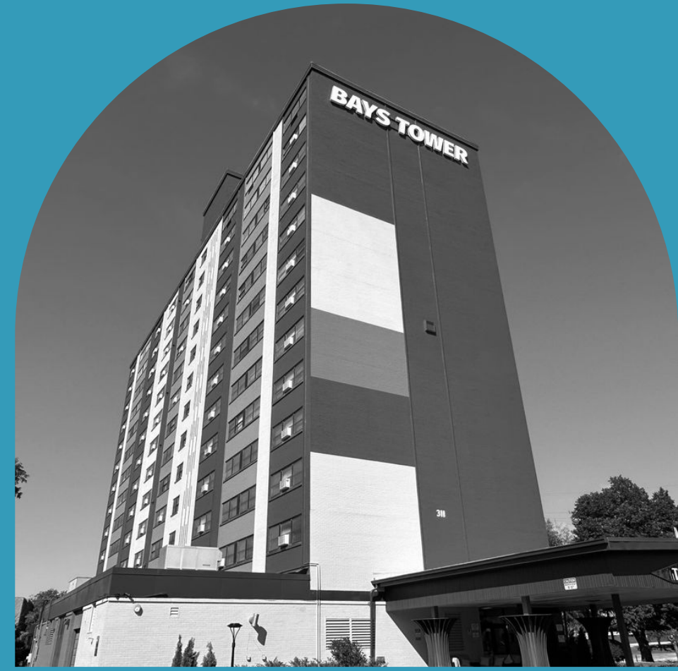
CATALITIC: $175,000 AWARDED