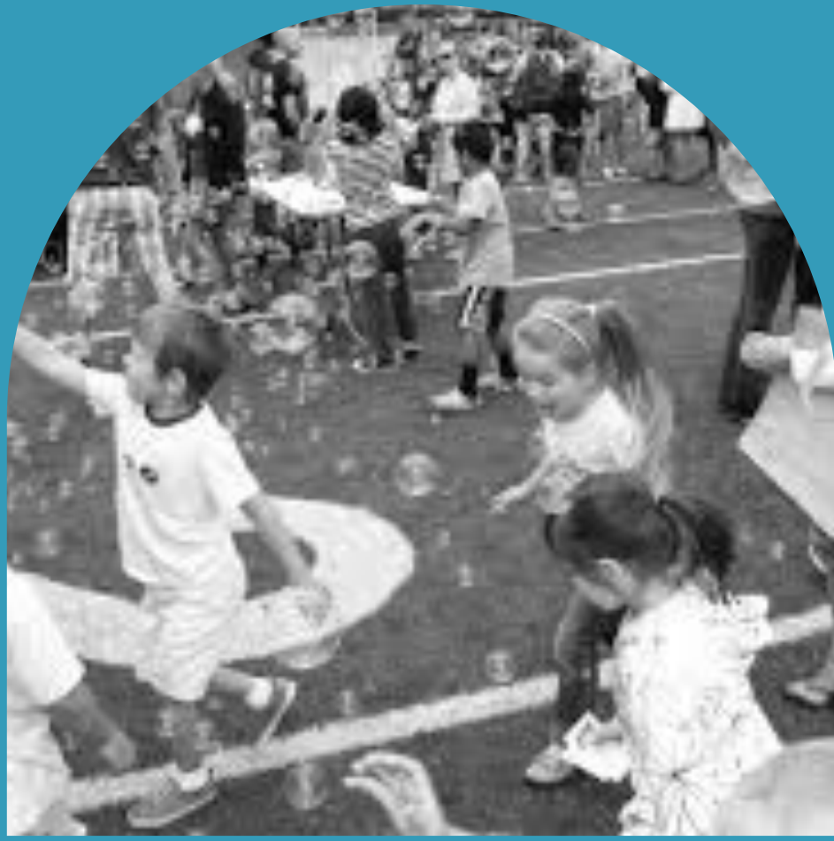
COMMUNITY EVENTS: $8,250 AWARDED SUPPORTING 12 BUSINESSES