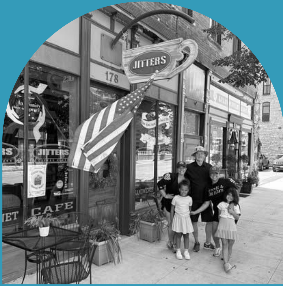
BUSINESS IMPACT GRANT: $13,299 AWARDED SUPPORTING 5 BUSINESSES