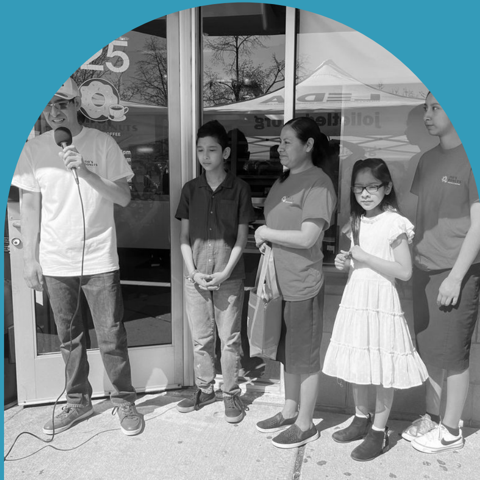
SMALL BUSINESS ASSISTANCE